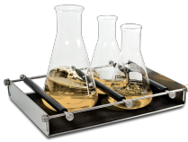
UP-12 BS-010108-AK platform

Universal platform with adjustable bars for different types of flasks, bottles, and beakers with silicone mat.