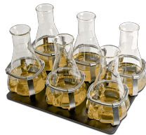
P-6/250 BS-010108-DK platform