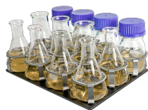
P-12/100 BS-010108-EK platform

Universal platform with adjustable bars for different types of flasks, bottles, and beakers with silicone mat.