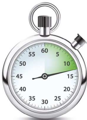
Agility® 12:55 min