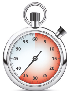
"Classic" ELISA analyzer 36:45 min